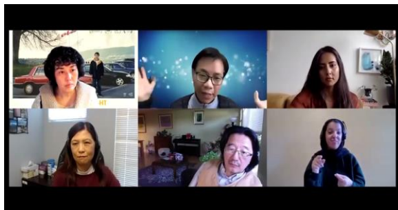
Photo credit: Screen capture of panel discussion on mental health within immigrant communities following a screening of the film The World is Bright originally streamed: October 24, 2020

The best way for families to get involved is to attend our public programs, such as the Being